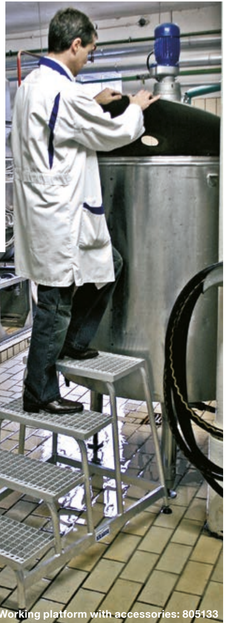
Working platform with accessories: 805133